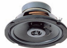
with professional 2-way coaxial chassis

This coaxial speaker chassis fulfills the professional demand for sound pressure and tone reproduction. Maximum capacity 40 W. A high-quality matching transformer supplies best music and speech quality.