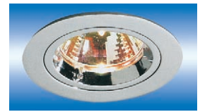
Design and dimensions particularly designed for the supplement of halogen light systems.